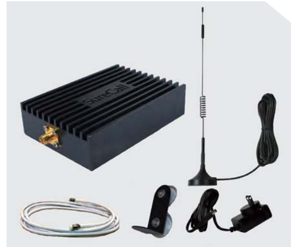
4G LTE with Suction-mount Antenna

Model SC-SOLOVI-15 for Verizon with Suction Mount Antenna